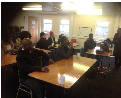
BEP Parents Meeting 26th March 2016