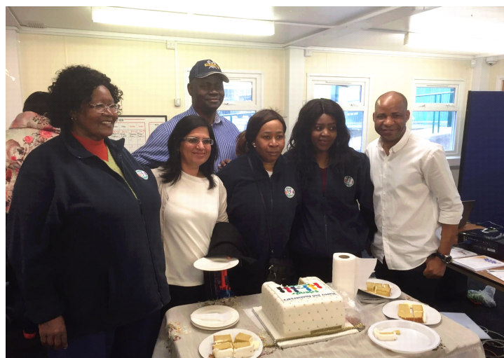
Cutting of the anniversary cake by the Chair of Friends of Barnfield