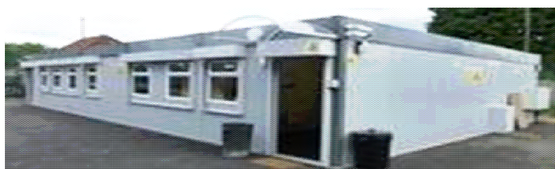
BEP location— Barnfield Hub, Herbert Place SE18 3BD