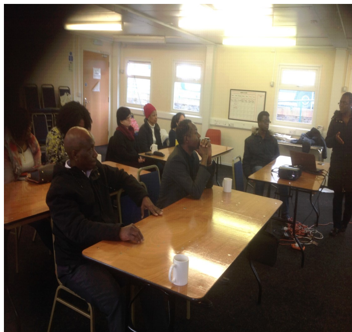
BEP Administrator updating parents on contribution