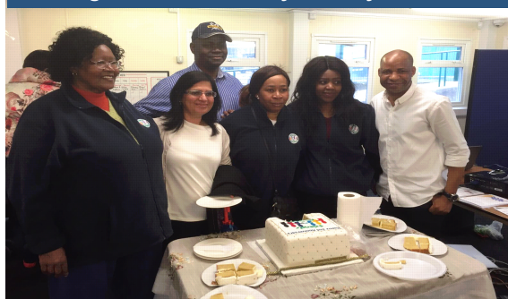
Cutting of the anniversary cake by the Chair