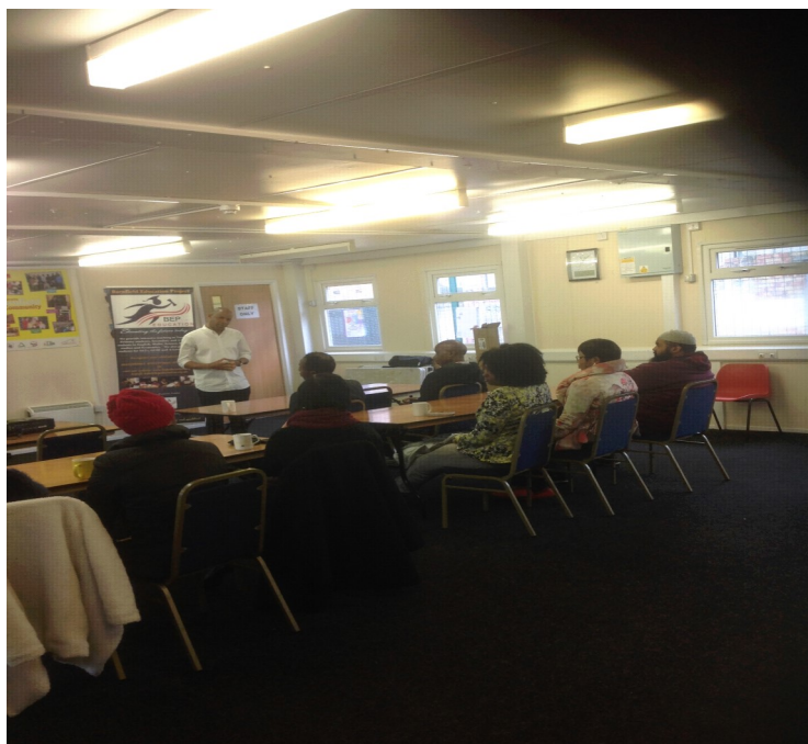
BEP Co-ordinator addressing parents