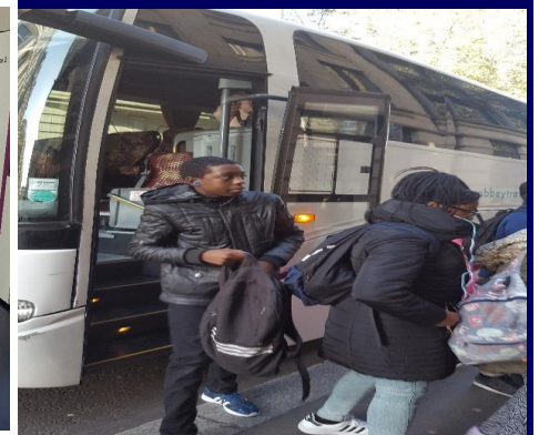
BEP students at Museum of London— 25th November 2017