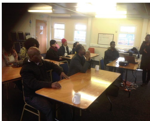
BEP Parents Meeting 26th March 2016