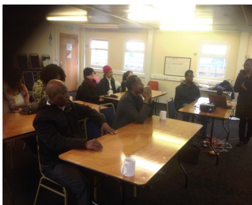
BEP Parents Meeting 26th March 2016